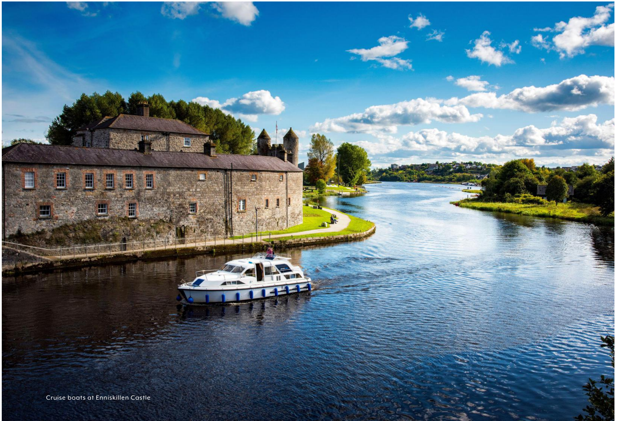
Cruise boats at Enniskillen Castle